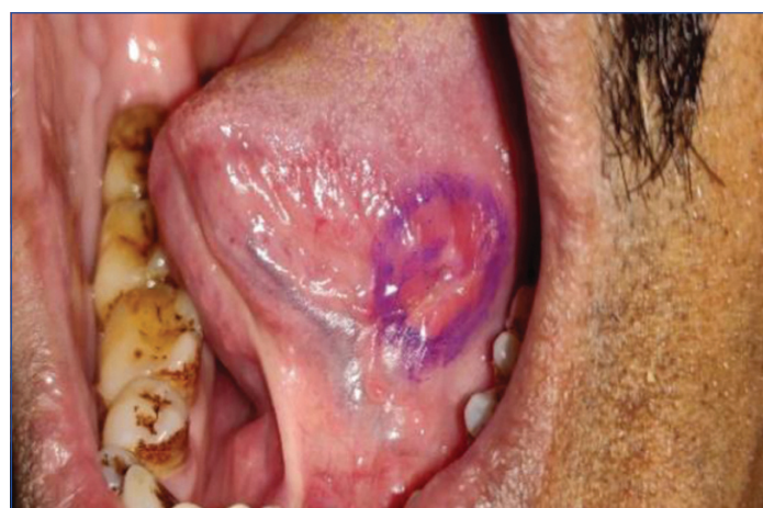
[Table/Fig-1]: Lesion on the lateral border of tongue.