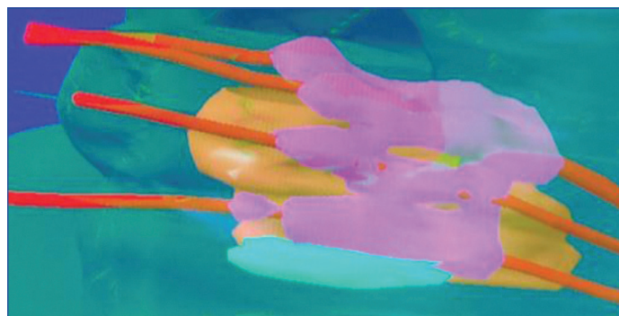
[Table/Fig-9]: Sagittal view computed tomography scan showing mould in position with radioactive sources.