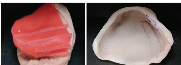
[Table/Fig-3]: Wax rolls showing placement of catheter tubes.