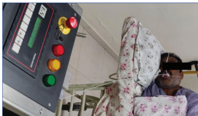
[Table/Fig-8]: Mock test.