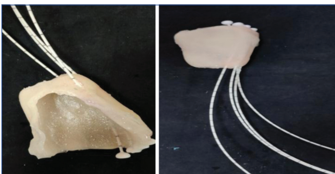
[Table/Fig-7]: Carrier device.